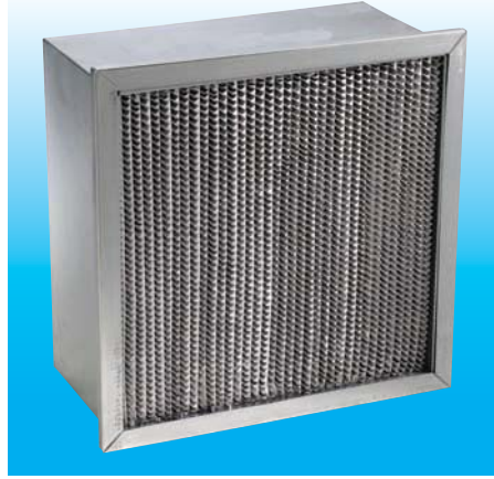
Style VMB - Single Header