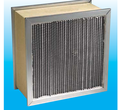
Style VFC - Double Header