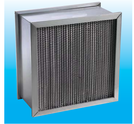
Style VMC - Double Header