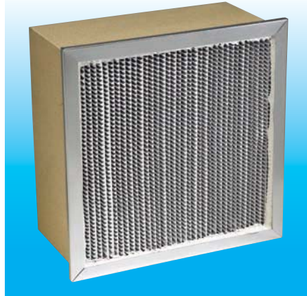
Style VFB - Single Header