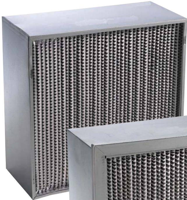
Box Construction (No header)