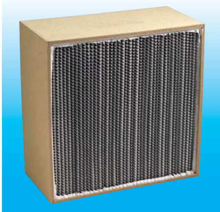
Style VFA - Box Construction (No header)