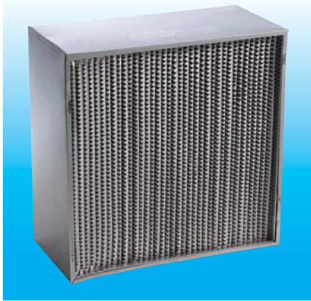
Style VMA - Box Construction (No header)